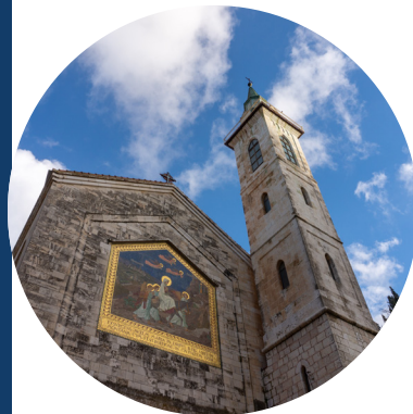
Church of the Visitation