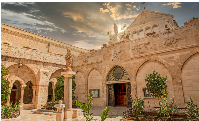
Church of the Nativity, Bethlehem

After breakfast, we will be shuttled to the airport to catch our return flight home.