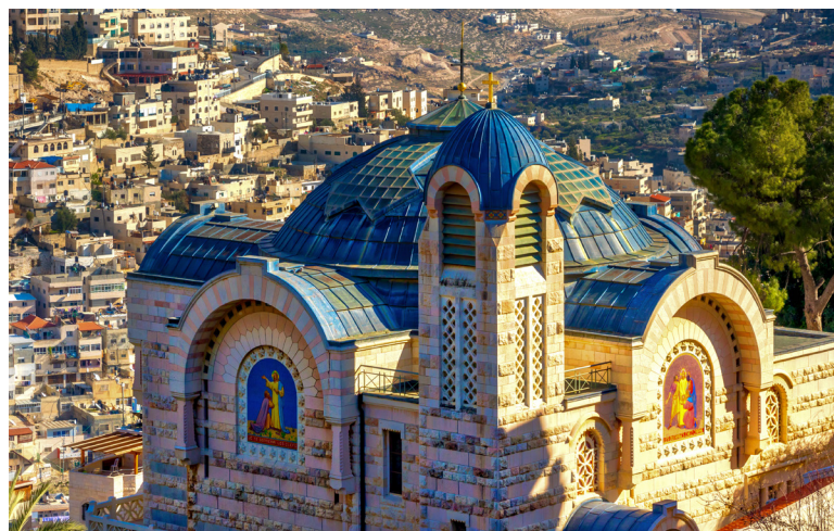
Church of St. Peter in Gallicantu